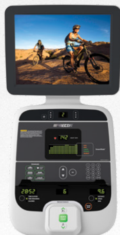
Streamlined LED Console with optional 15" Personal Viewing System