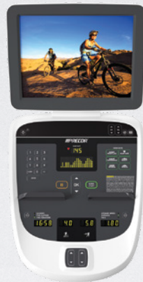
P10 Console with optional 15" Personal Viewing System