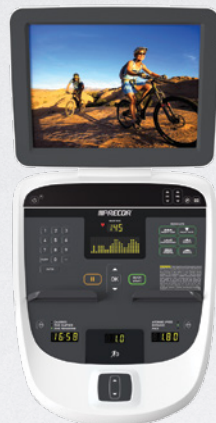
P10 Console with optional 15" Personal Viewing System