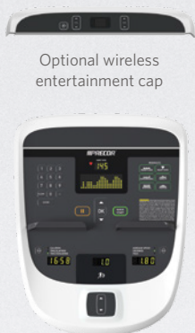
Optional wireless entertainment cap

Warranty: Visit www.precor.com for warranty terms