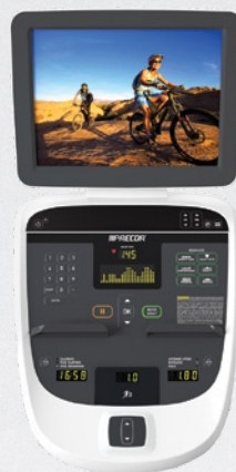
P10 Console with optional 15" Personal Viewing System